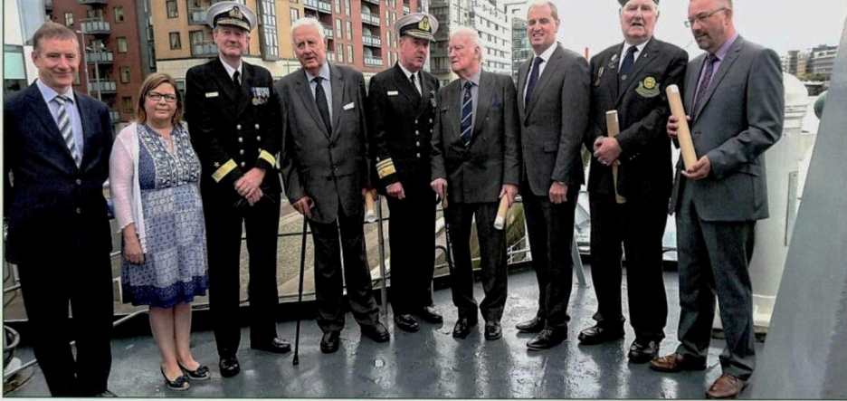
On the 1st September 2016, the Minister with Responsibility for Defence, Mr. Paul Kehoe, TD presented Scrolls of Commendation to former crew members of the LÉ Cliona at a ceremony held on board the L. É. Niamh in Dublin.